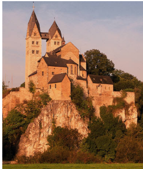
Revival Fellowship International Inc. Restoration Revival Tracts

I suggest reading Proverbs 21-30 frequently since these chapters deal with instructions to KINGS.